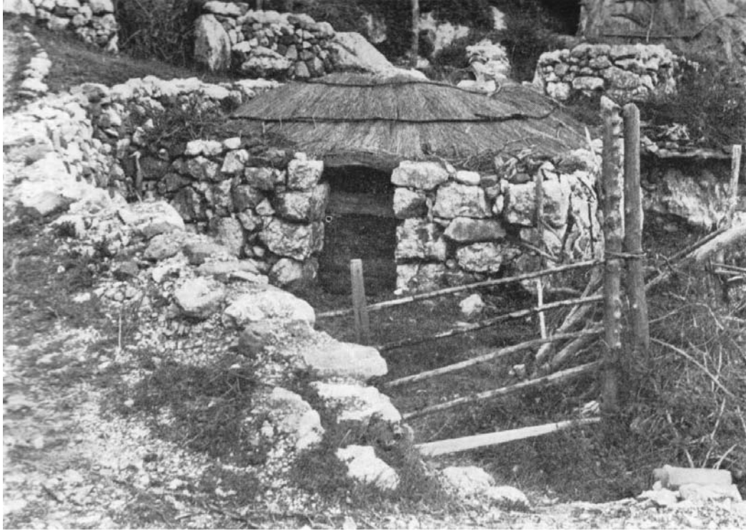
At least thirty years ago