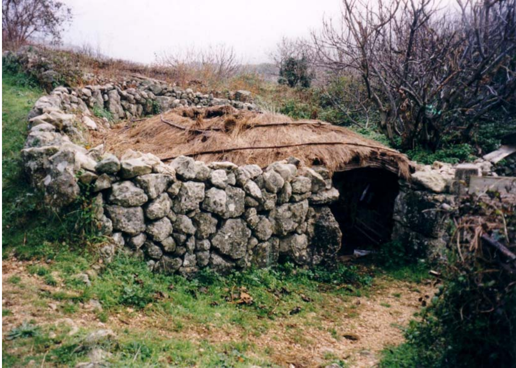
As found on 16th November 1999 – with the roof in bad shape and doomed to be pulled down by the end of the year.