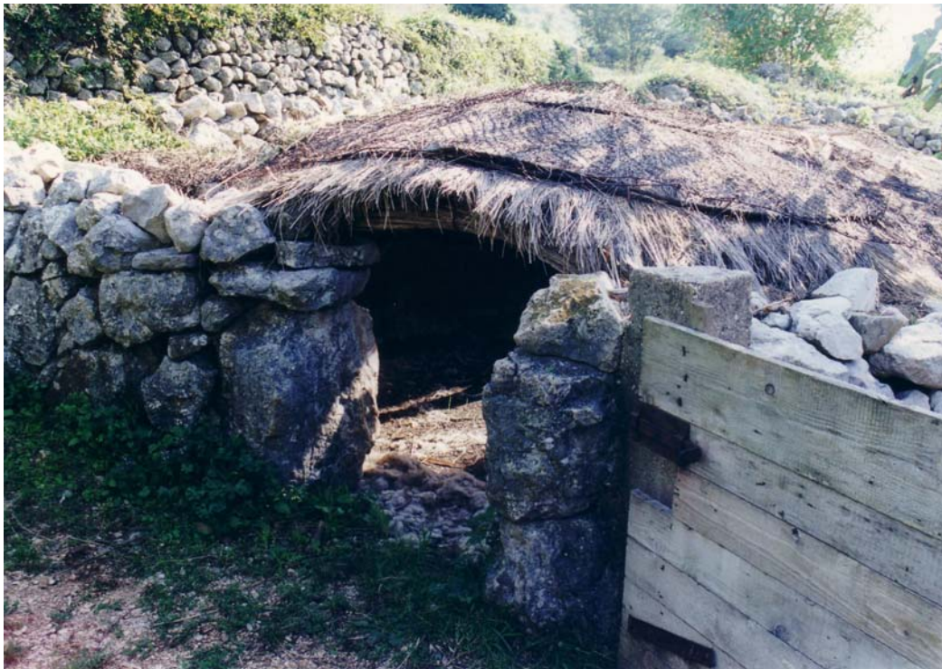
The entrance in the corner of the front elevation