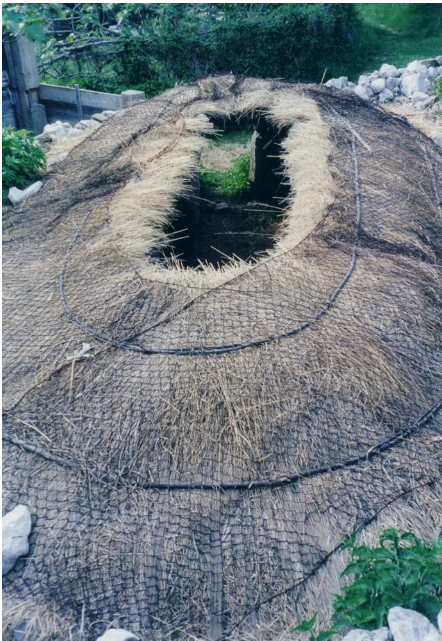
The oval domed thatched roof with the oblong central opening ( zjalò ) – simply a lovely sight!