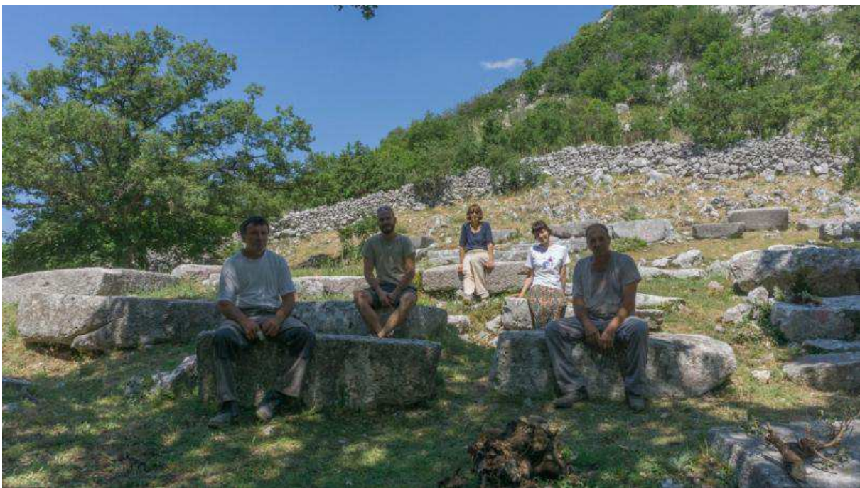
Photo: Dry stone artisans and volunteers taking a break after rebuilding a wall surrounding UNESCO protected medieval church with tombstones in Konavle, 2019