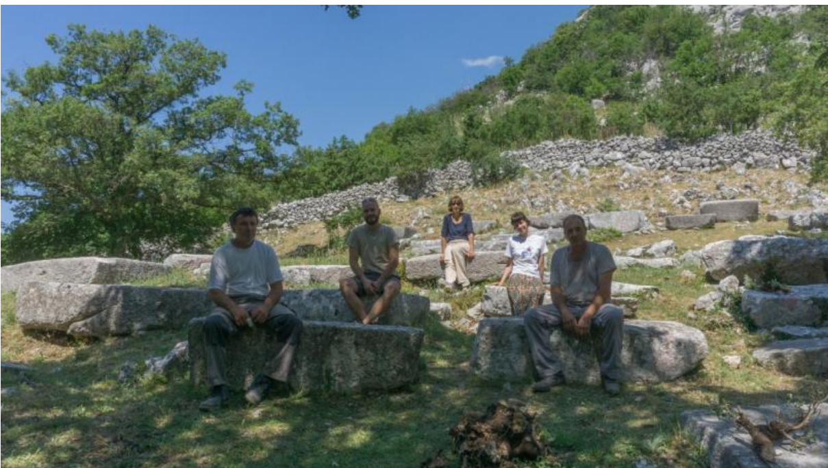
Photo: Dry stone artisans and volunteers taking a break after rebuilding a wall surrounding UNESCO protected medieval church with tombstones in Konavle, 2019